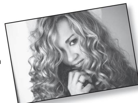
Dana Fuchs Band